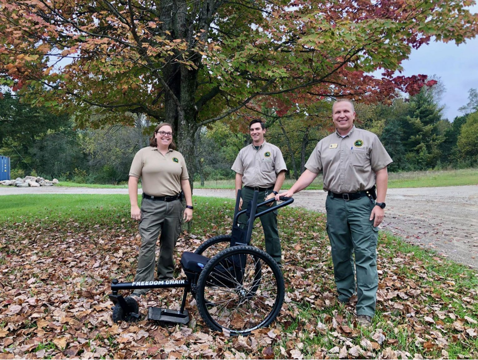
Michigan State Parks Island Lake Recreation Area