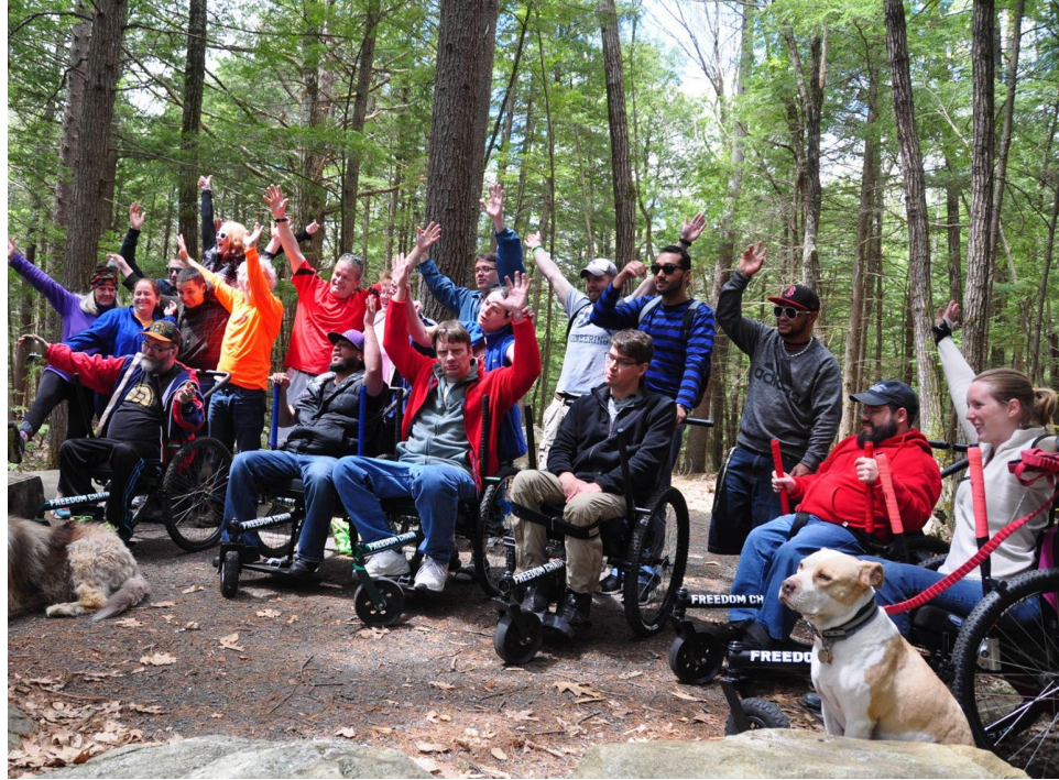
Massachusetts Department of Conservation and Recreation, Universal Access Program