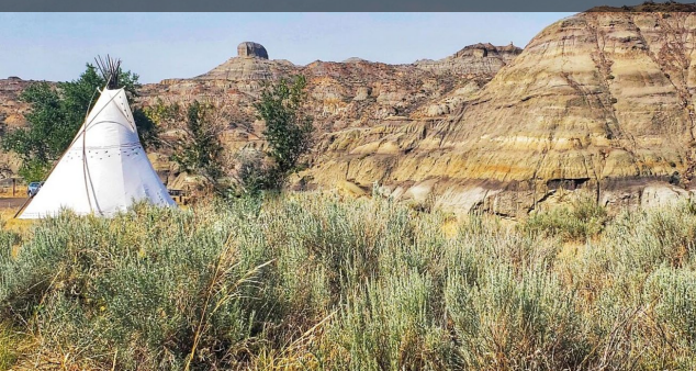
Montana State Parks