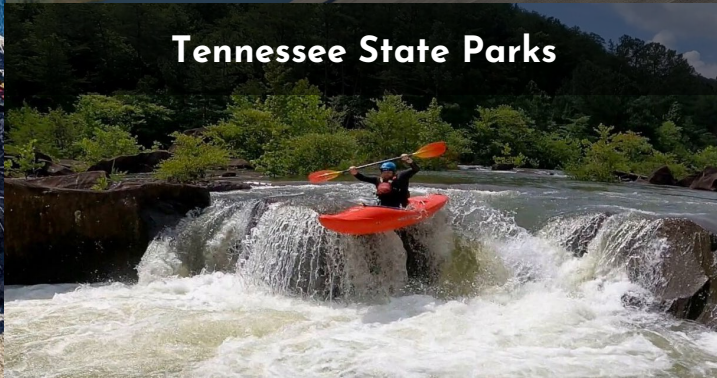
Tennessee State Parks