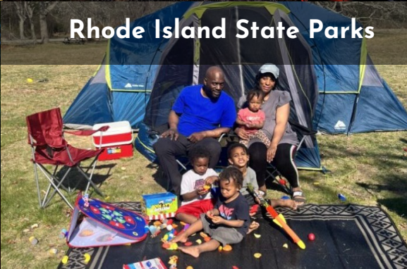
Rhode Island State Parks