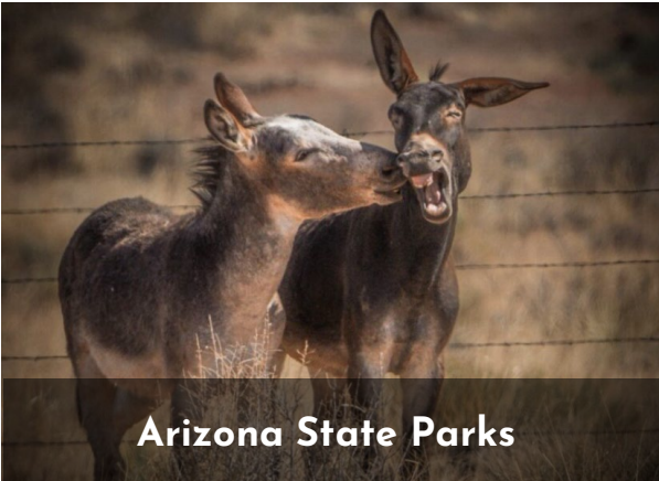
Arizona State Parks