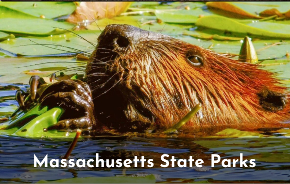
Massachusetts State Parks