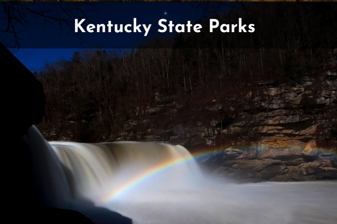
Kentucky State Parks