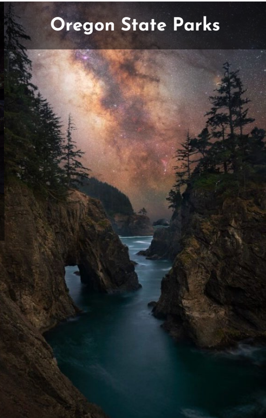
Oregon State Parks