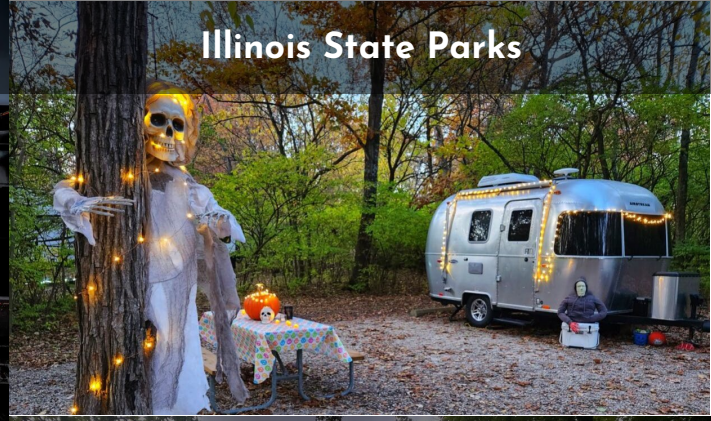
Illinois State Parks