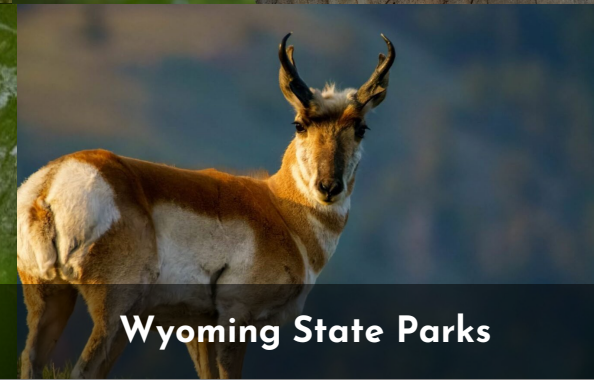
Wyoming State Parks