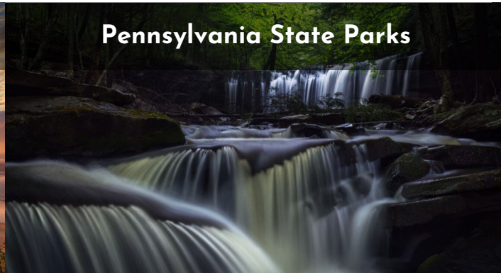
Pennsylvania State Parks