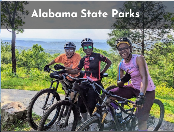
Alabama State Parks