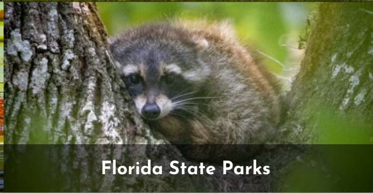
Florida State Parks