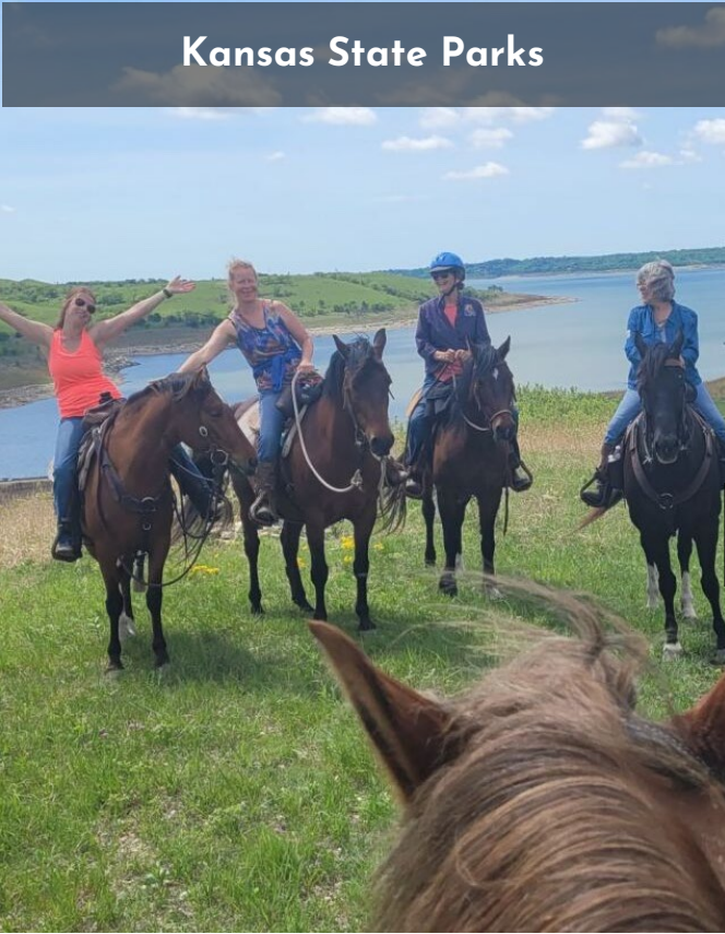
Kansas State Parks