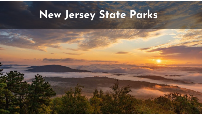
New Jersey State Parks