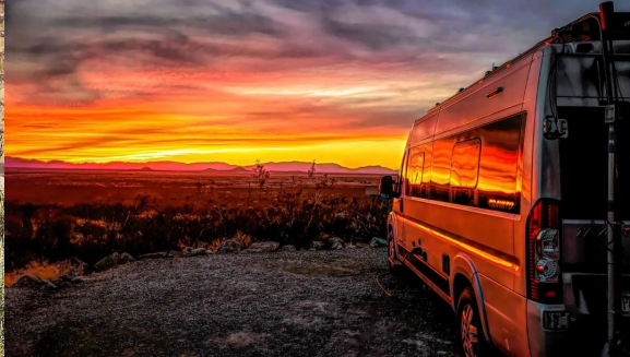
New Mexico State Parks