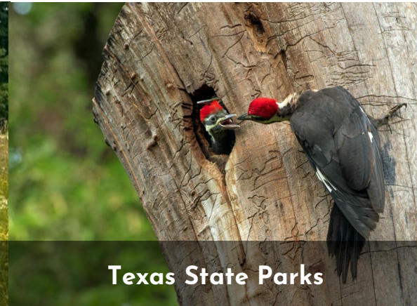
Texas State Parks