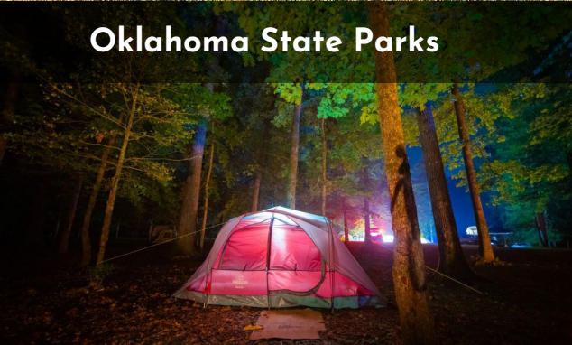
Oklahoma State Parks