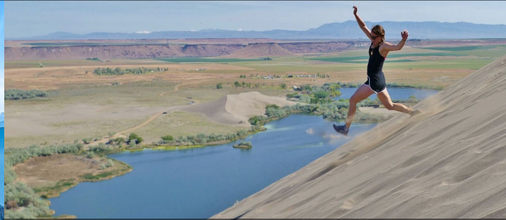
Tennessee State Parks