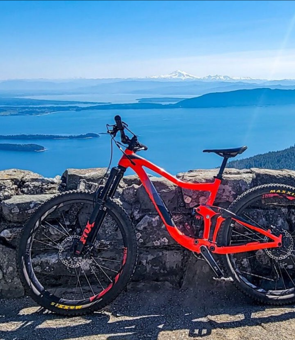
New Hampshire State Parks