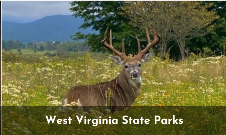
West Virginia State Parks