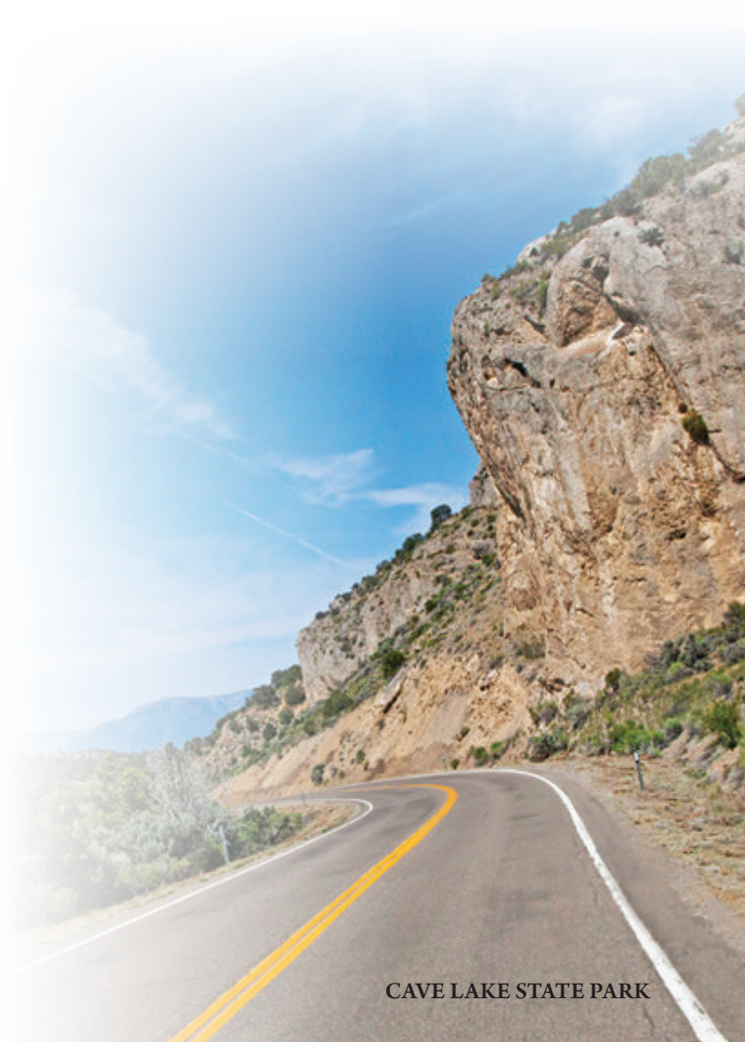
CAVE LAKE STATE PARK

Full bios for all of the speakers are available online on the conference website and on the WHOVA app! Thank you to all of our 2023 speakers, guests and attendees.