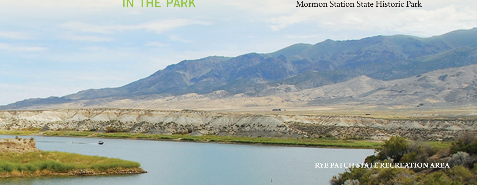
RYE PATCH STATE RECREATION AREA