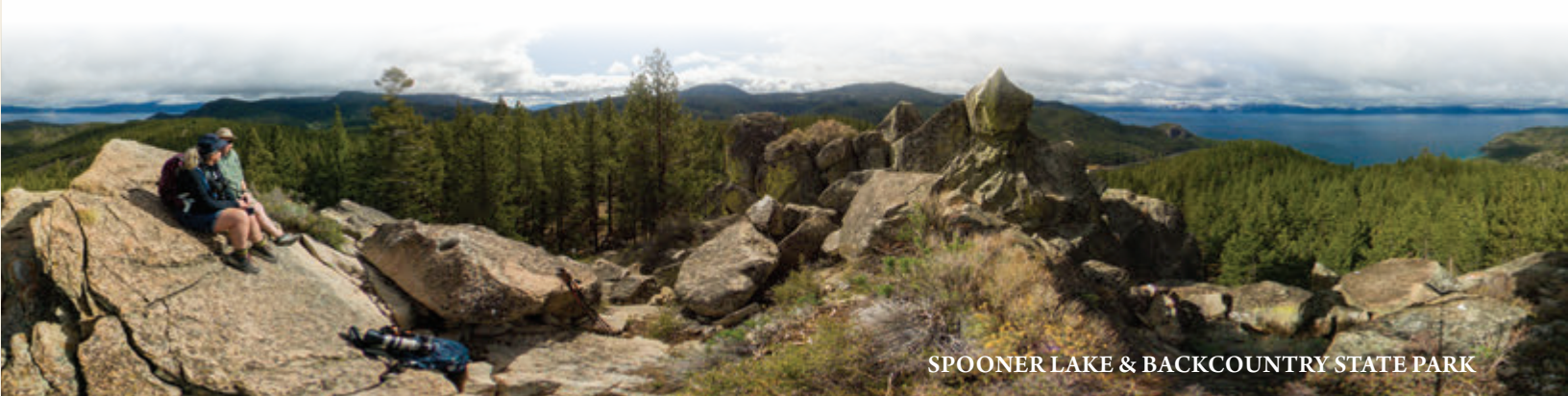
SPOONER LAKE & BACKCOUNTRY STATE PARK