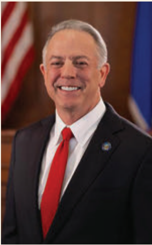
JOE LOMBARDO Governor of Nevada

After serving the nation in the United States Army and the Nevada National Guard, Joe Lombardo rose through the Las Vegas Metropolitan Police Department ranks over 26 years. He was elected as Sheriff of Clark County in 2014 and re-elected in 2018. Governor Lombardo was elected as the 31st Governor