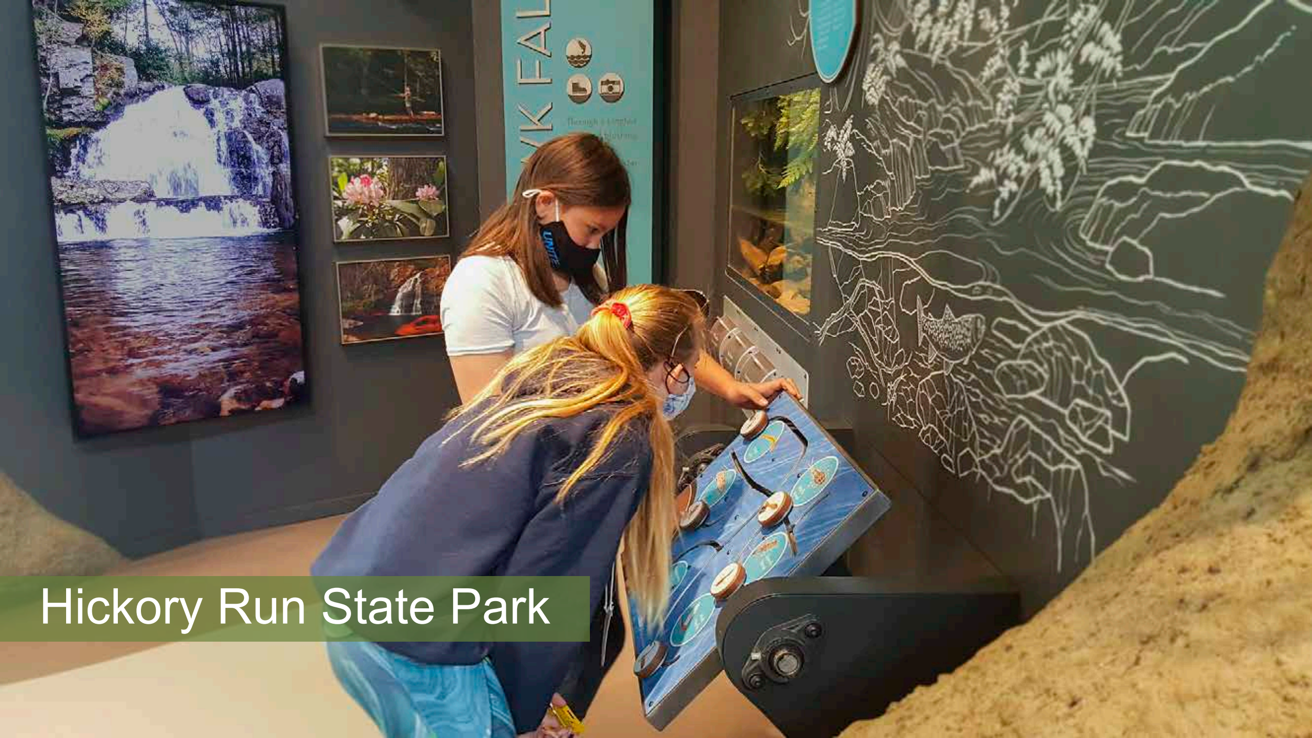
Hickory Run State Park