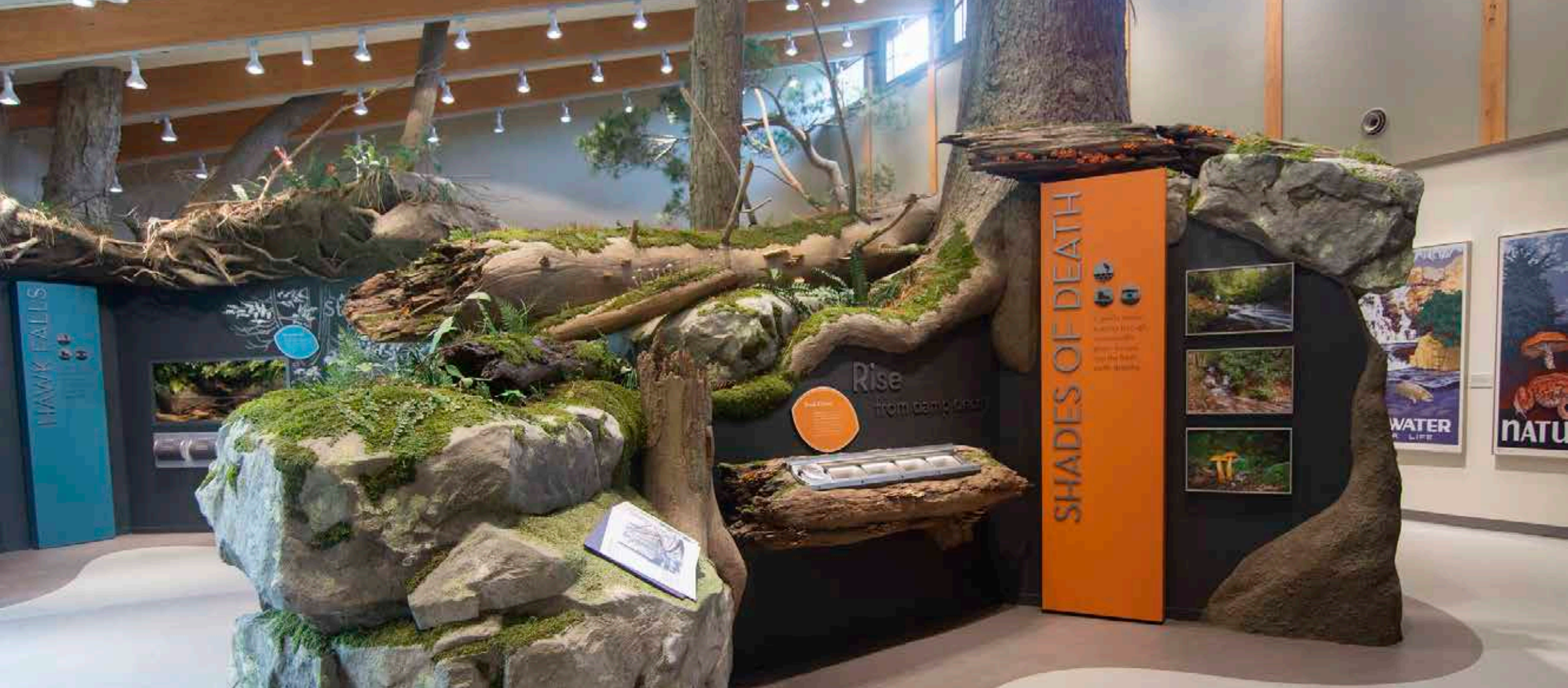
Hickory Run State Park