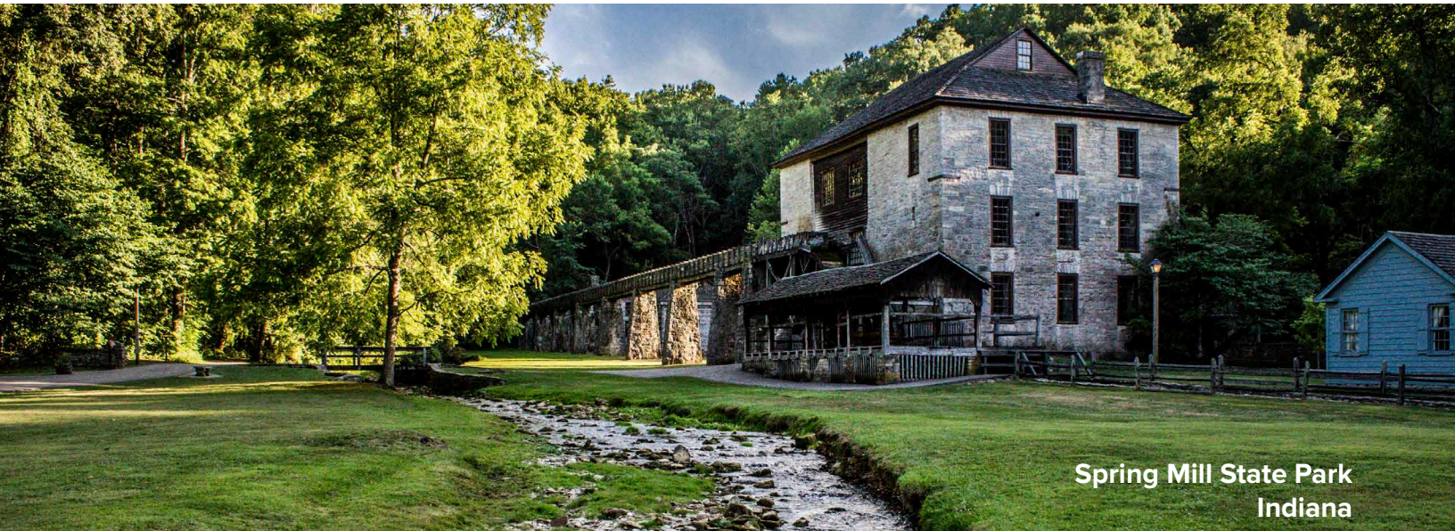
Spring Mill State Park Indiana