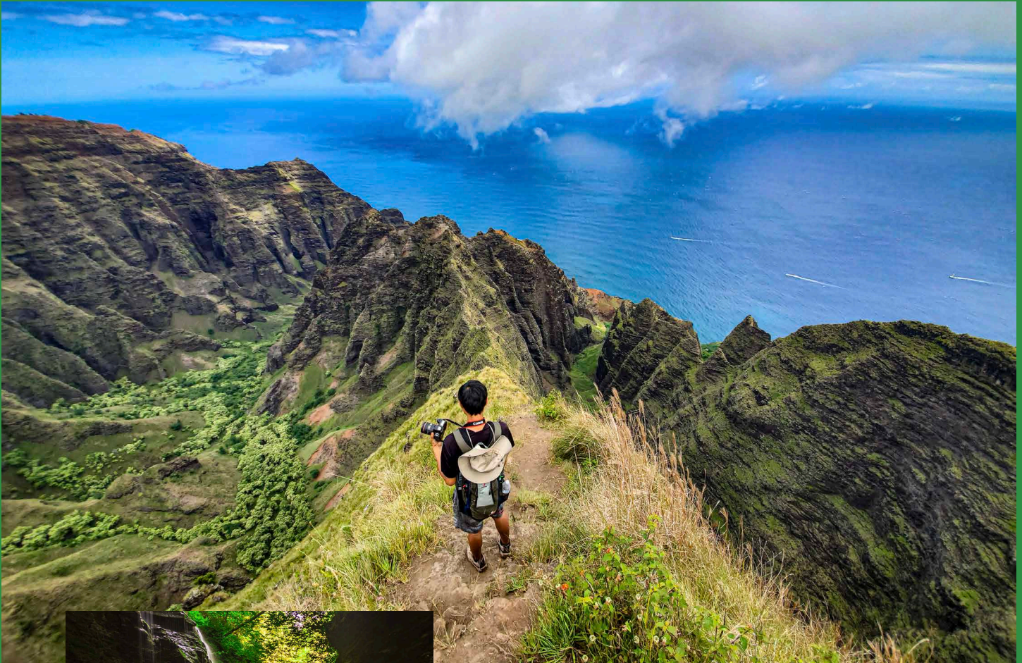
Nā Pali Coast State Wilderness Park Hawaii